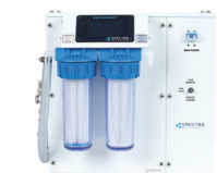
Local Spectra Connect Controller